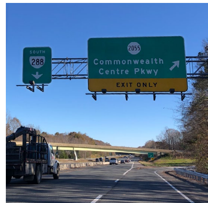
exit off of Rt 288 South